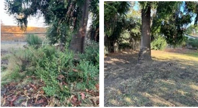
Park Clean Up