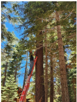
Photo on top right: Installing new electrical cables to power the campground.

Several projects at Camp Shelly were also completed, including plumbing repairs and improvements, phone line repairs, and general clean-up of the camp sites.